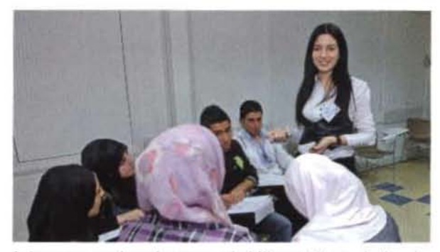
interpersonal and personal skills and knowledge to enter the Lebanese and the global market.

By volunteering with INJAZ, YOU empowered youth to believe in their boundless potential, inspired them to make a difference in the world and endowed students with academic, organizational,